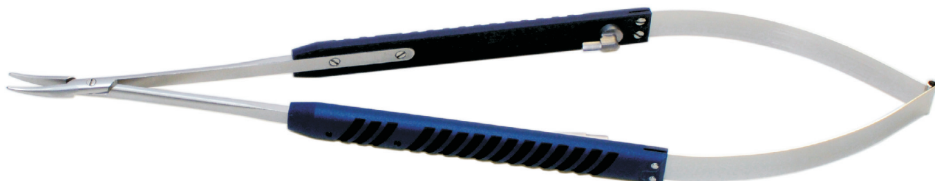
28.3633AL MICRO-Needleholder 18 cm curved w.lock