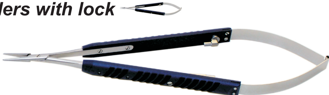
28.3630AL MICRO-Needleholder 15 cm straight w.lock