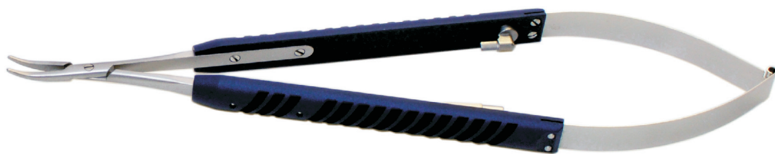
28.3631AL MICRO-Needleholder 15 cm curved w.lock