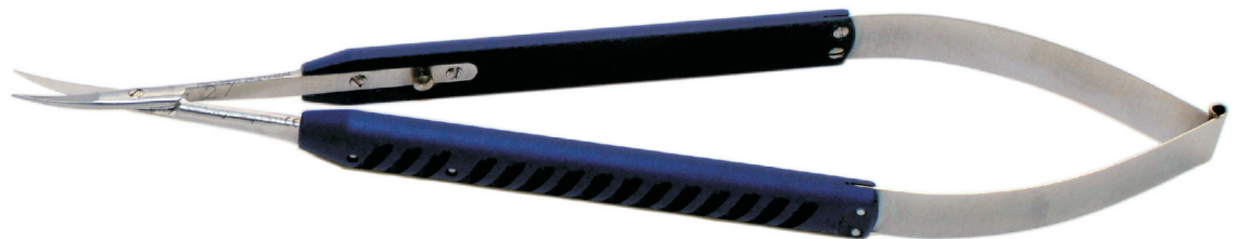
28.2123AL MICRO-SCISSORS 15 cm curved