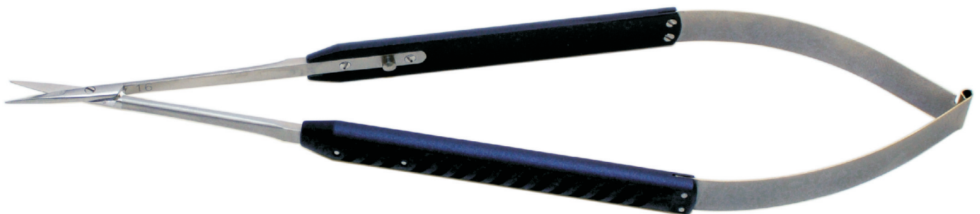
28.2122AL MICRO-SCISSORS 18 cm straight