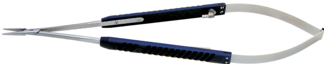
28.3632AL MICRO-Needleholder 18 cm straight w.lock