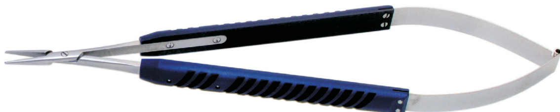
28.3600AL MICRO-Needleholder 15 cm straight