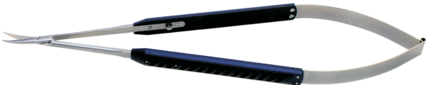
28.2123AL MICRO-SCISSORS 18 cm curved